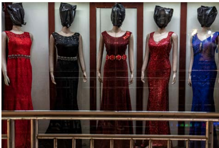
Hooded mannequins are a symbol of Taliban rule in Afghanistan.

The courageous women protesters are risking a great deal and their demonstrations are repeatedly broken up by force. During the first Taliban regime, however, such protests would have been completely unthinkable, since at the time, if women committed even the smallest legal violations, they risked severe penalties – including death – not only for themselves, but also their husbands.