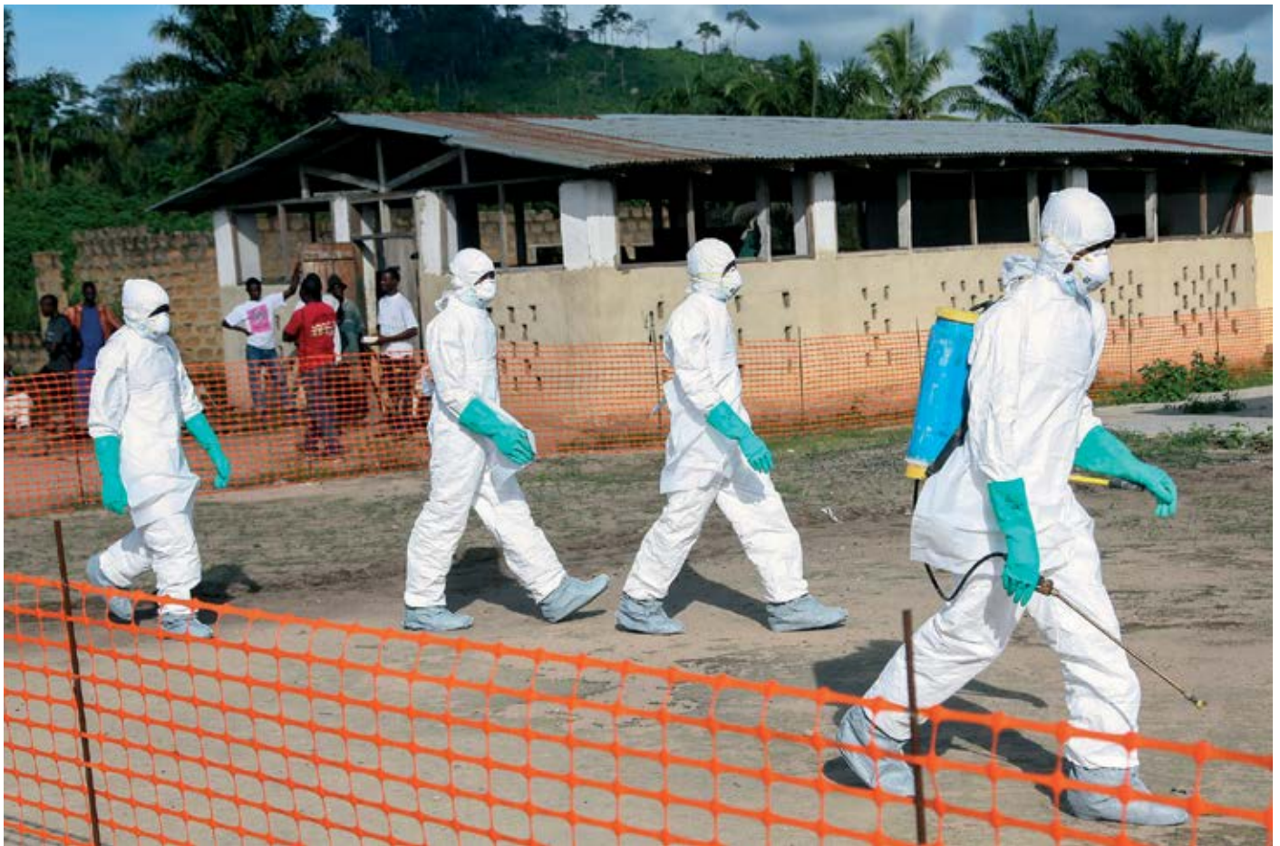
Liberian healthcare workers in 2014. Medical anthropologists were on site during the Ebola outbreak that was happening at that time.