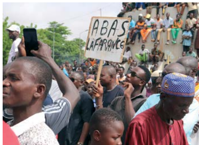
Pro-coup demonstration in Niger's capital Niamey.