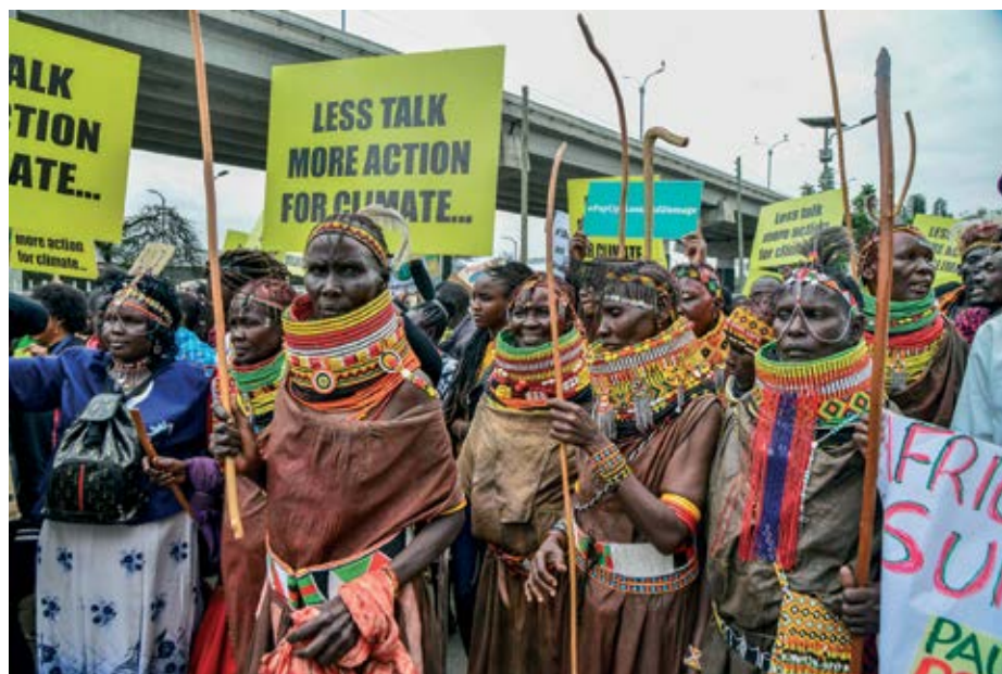
Climate protest in Nairobi on the summit's first day.