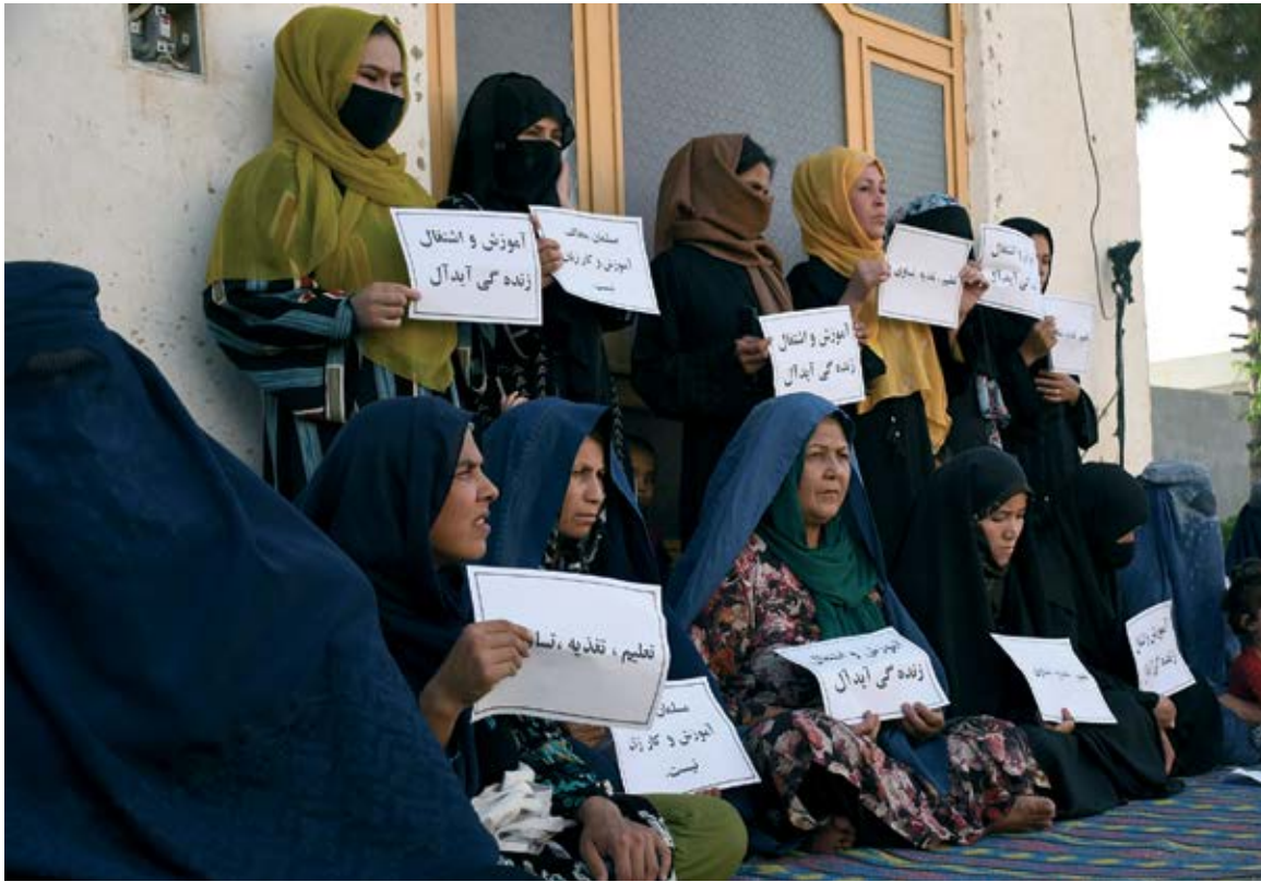
Afghan women demand the right to education and work in Mazar-i-Sharif.