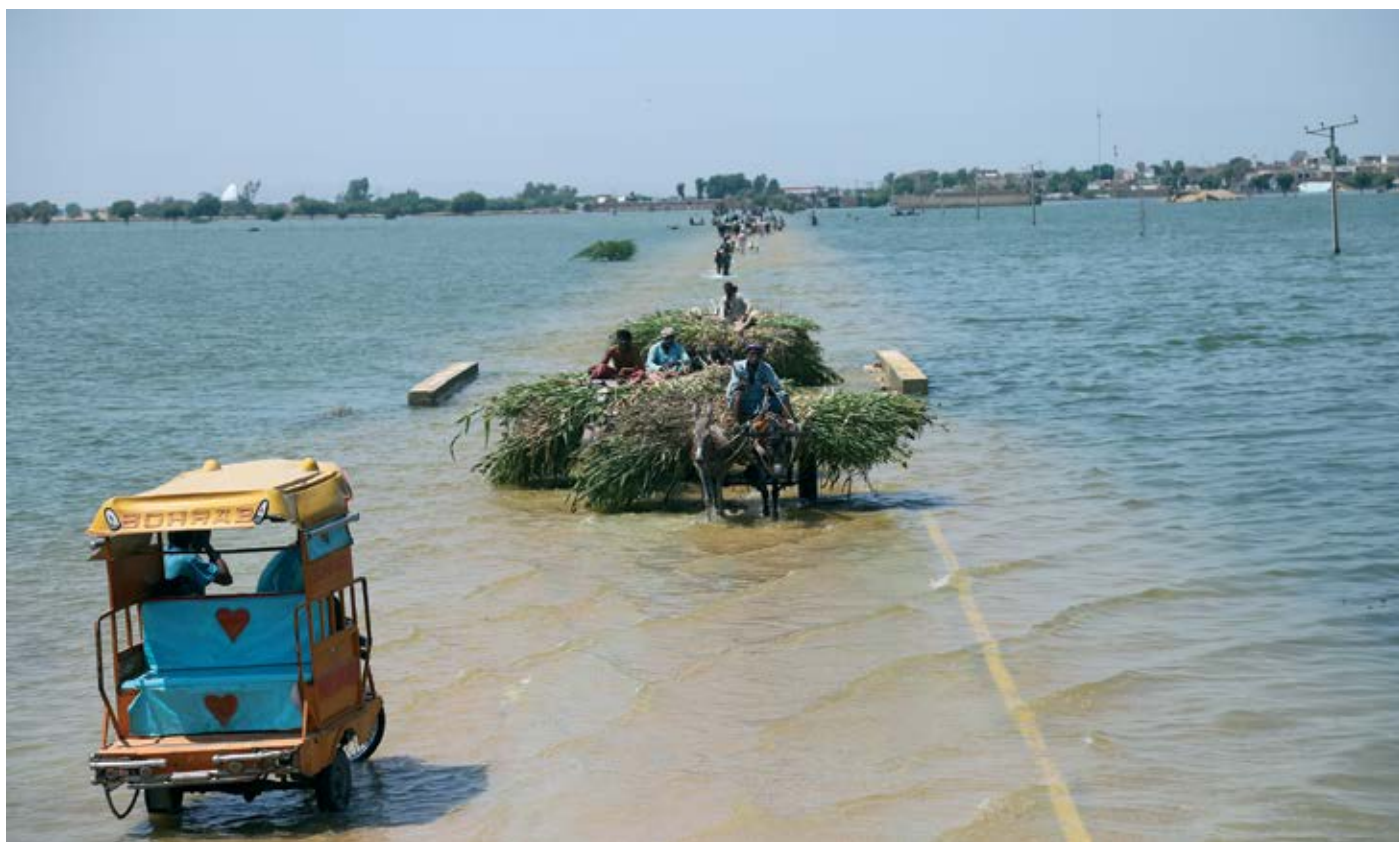
Flooded rural road in Sindh Province in September 2022.