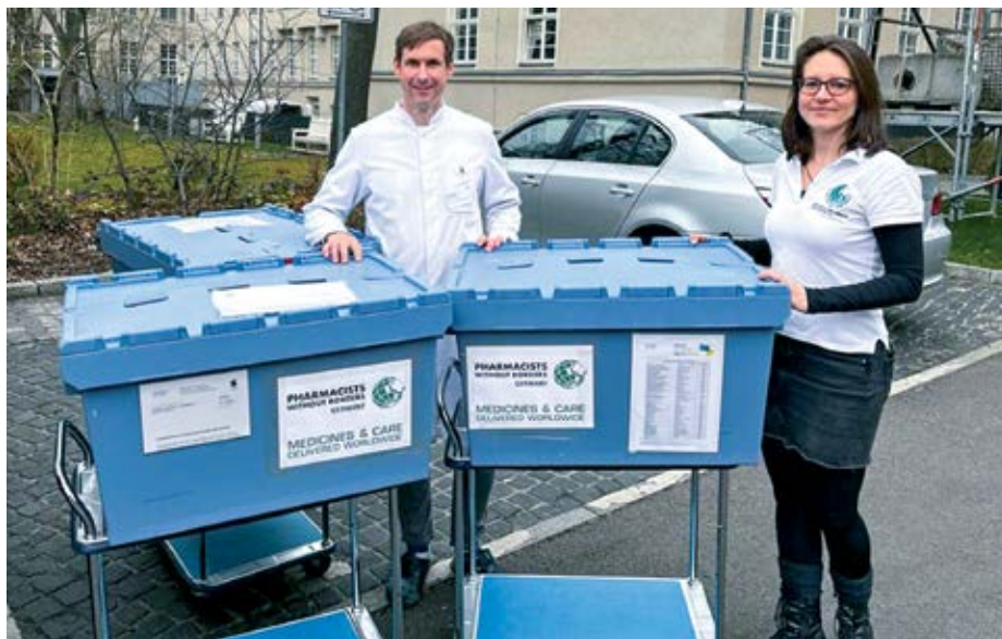
Handing over emergency trauma kits to AoG's Ukraine coordination team.