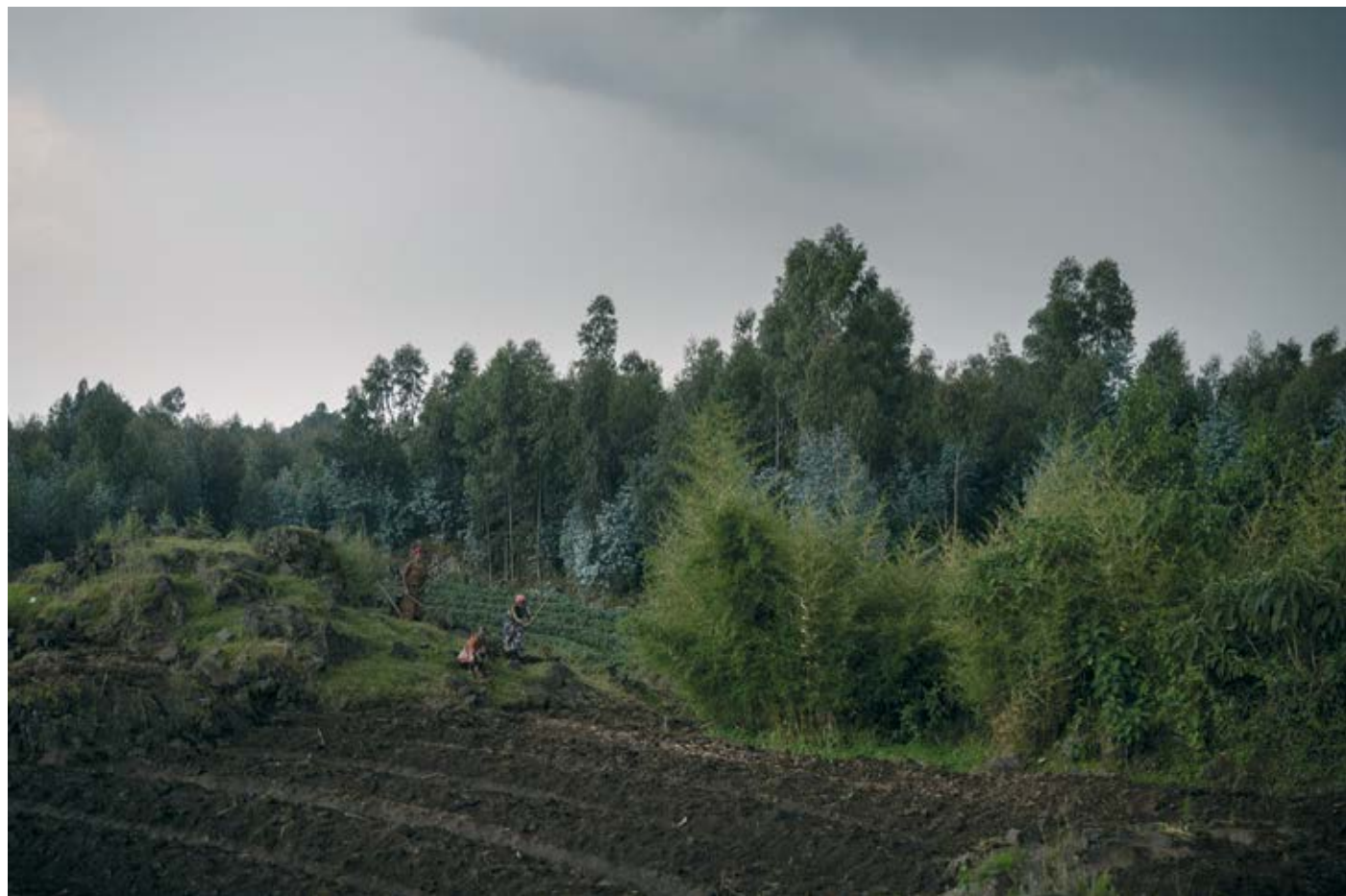
Farmers work on their land near the Volcanoes National Park in Rwanda. Demand for agricultural land impacts Africa's biodiversity.