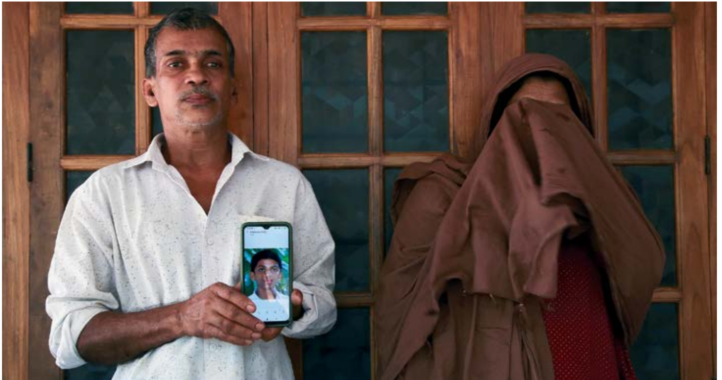
The parents of a boy who died from a Nipah infection in Kerala in 2021 with a picture of their son.