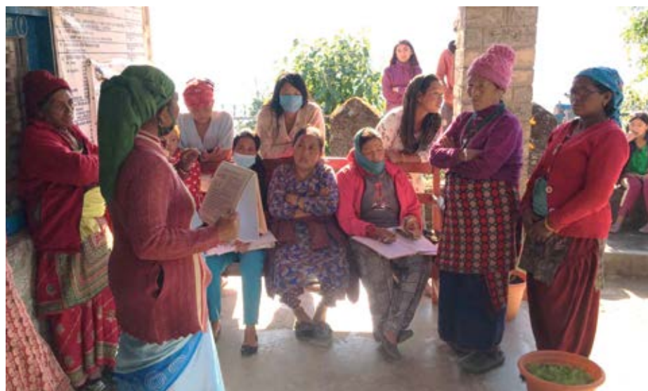
Childaid orientation on nutrition and other maternal health issues in Ramechhap district, 2023.