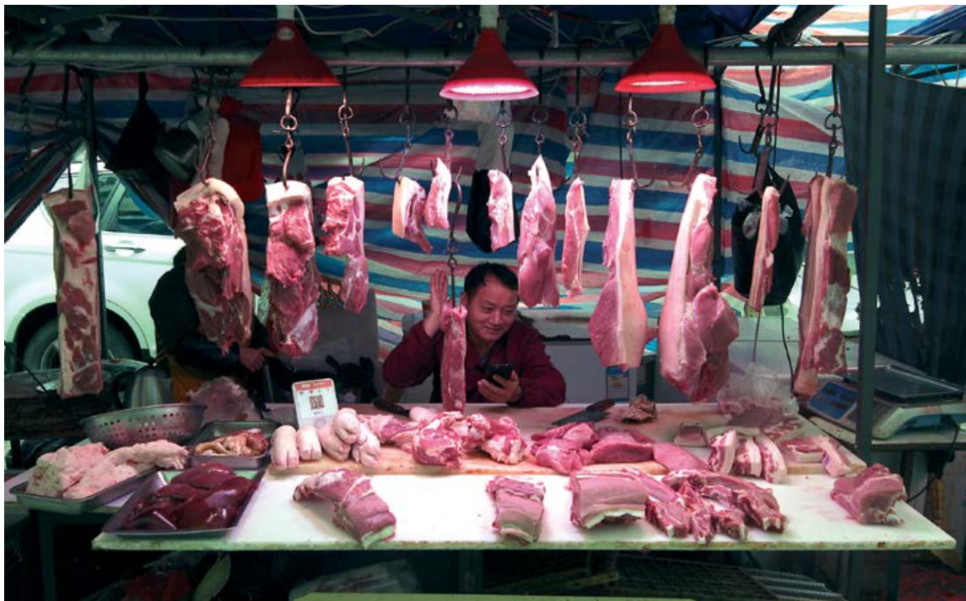
Meat vendor in Wuhan: the global Covid-19 pandemic's epicentre was a wet market in this Chinese city.

hunting reduces biodiversity. On the other hand, meat of infected animals may be infectious itself. The report stresses that scientists trace the zoonotic Coronavirus pandemic back to a wet market in Wuhan.