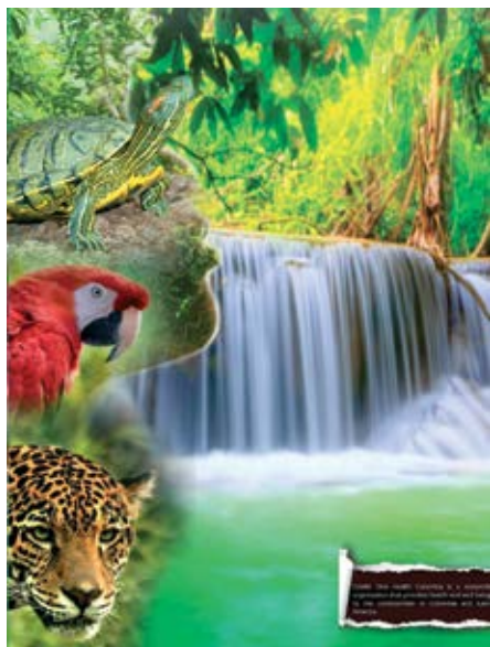
Another One Health Colombia illustration.

The point is that OH experiences differ from culture to culture and place to place, so policy approaches must differ too. It is striking, for example, that OH tends to be a bottom-up issue in low- and middle-income countries. Grassroots movements play an important role. There is a pattern of university researchers focusing on the health concerns of local – and especially marginalised – communities. In most cases, the people involved get hardly access to funding. Research is typically done ad-hoc in small individual projects.