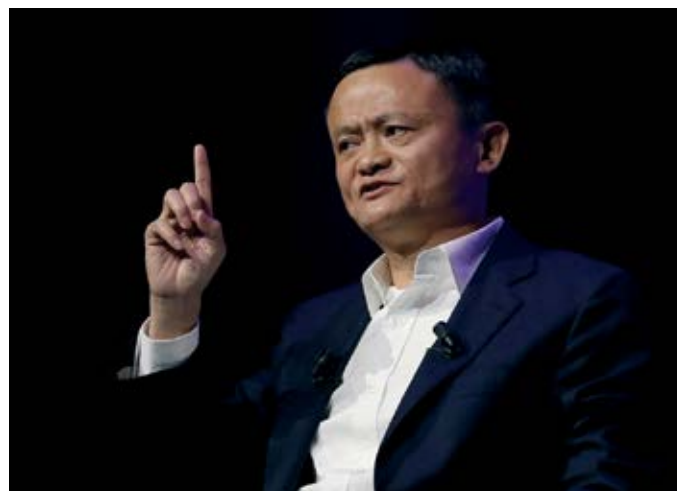
After criticising the government, Jack Ma disappeared from public life in 2020.