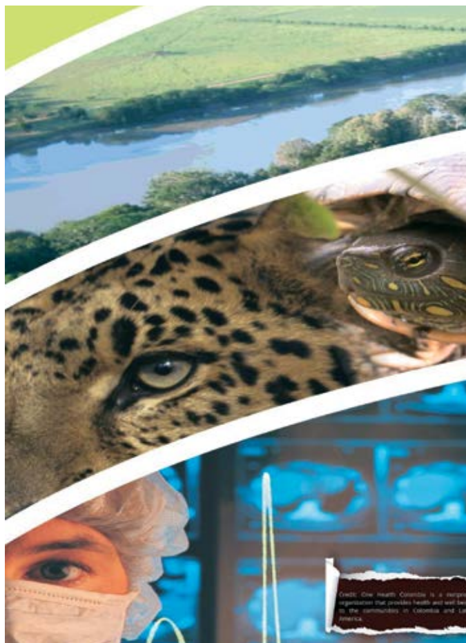
An illustration prepared on behalf of One Health Colombia, a non-governmental initiative, for a conference.

Moreover, an authentic OH approach must take into account social disparities. That is true at global, national and subnational levels. While access to healthcare is important, other dimensions of social injustice matter too. The exposure to health risks is quite unequal after all. Typically, disparities coincide with divisions of race, gender and ethnicity. Medically underserved communities are often forced to live and work in environments that are comparatively dangerous for various reasons. The natural conditions can be hazardous, but habitat degradation, pollution and other human-made issues can be detrimental to humans, animals, plants and the ecosystems.