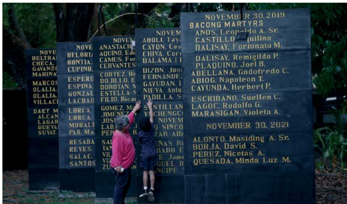
The Bantayog ng mga Bayani (Heroes' Monument), a monument in Quezon City honouring the victims of the dictatorship of former President Ferdinand Marcos.