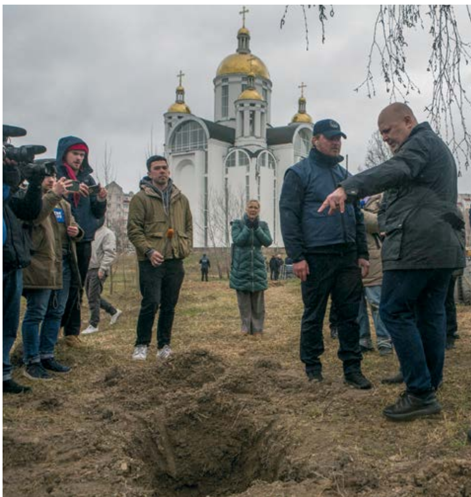
ICC Prosecutor Karim Khan (right) on investigative mission in Ukraine.

They talk to witnesses and forensically secure the crime sites. For example, they can have bodies exhumed to determine whether executions took place. Digital evidence, moreover, is becoming increasingly important. It includes satellite images or evidence from social media. Compiling all relevant information is a major challenge.