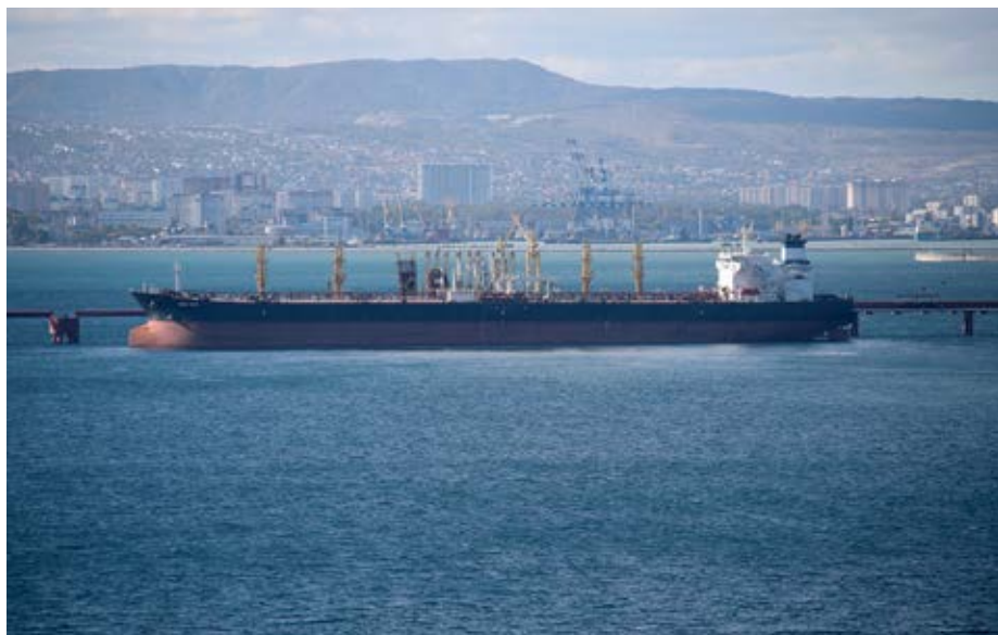
Oil tanker in Novorossiysk in October 2022.

Currently, the oil market seems relaxed, but that can change fast. It is particularly difficult to assess what further impact sanctions on Russia will have. Moreover, the end of China's Covid-19 lockdowns will most likely lead to an increase in oil demand, which could raise the oil price. Such a turn, however, could be mitigated by OPEC+ production adjustments.