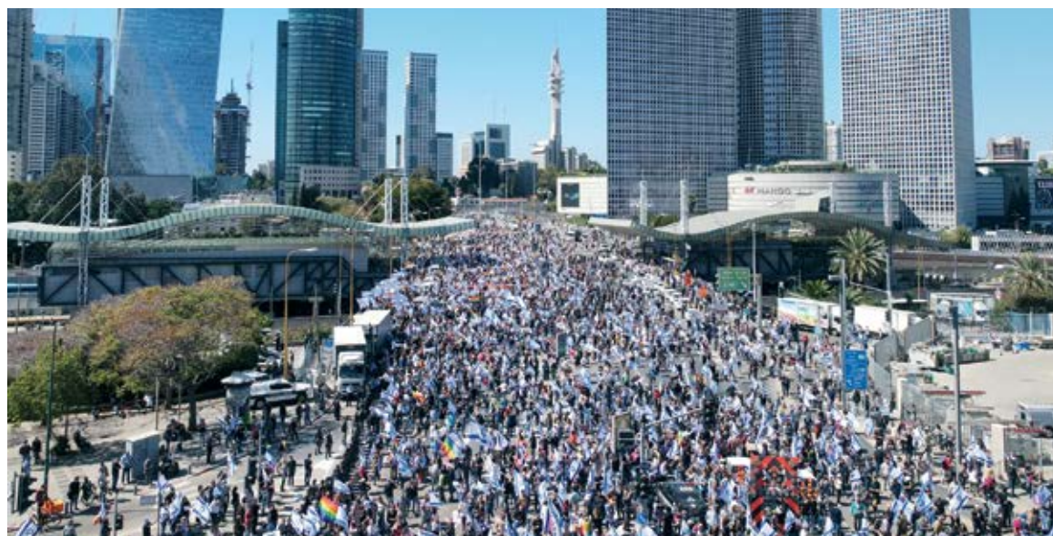
Rally in support of independent judiciary in Tel Aviv in early March.