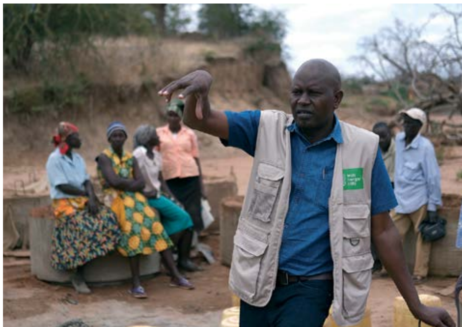
Visiting a Welthungerhilfe project in Kitui County, Kenya, for journalistic research.