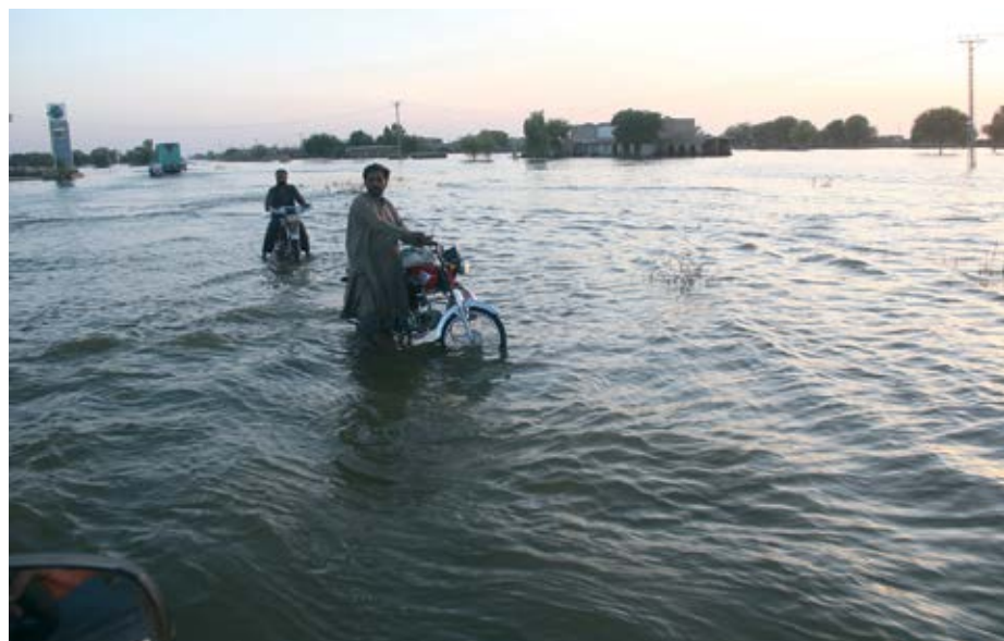
"If an economy cannot cope with external shocks like a series of extreme-weather events, it is not stable": flooding in Pakistan in 2022.

The message sounds correct, but I'm not sure I agree with every detail of their argument. I'd like to raise a different point. The country that was most successful in reducing poverty in the past 40 years was China. The fall of global poverty was primarily due to that one country which did not necessarily follow the IMF advice. It liberalised markets in an experimental way, but China's state kept playing a strong role in many sectors, including infrastructure and education in