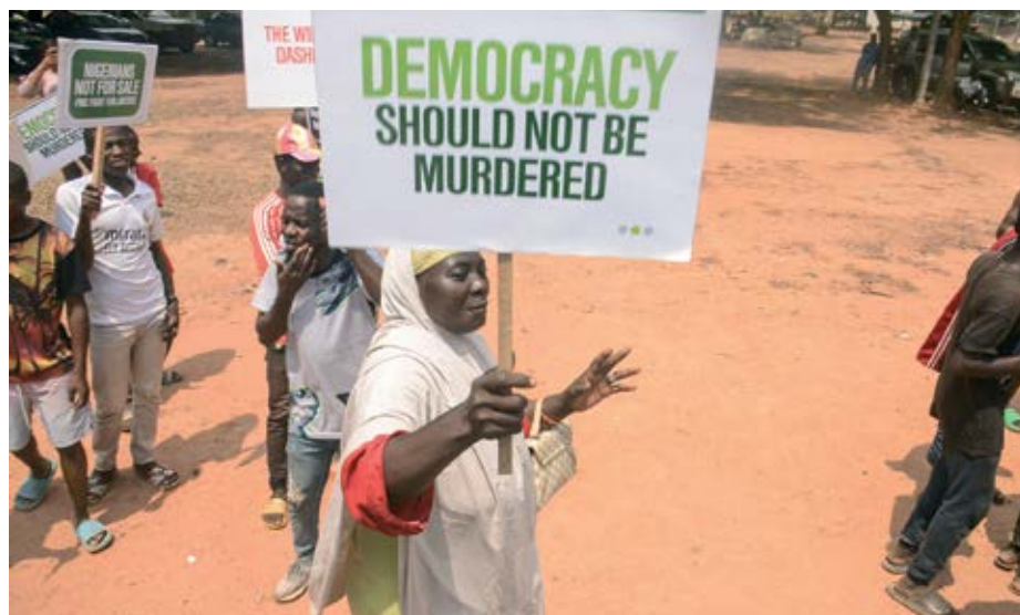
Peaceful protests show that many Nigerians find official election results unconvincing.