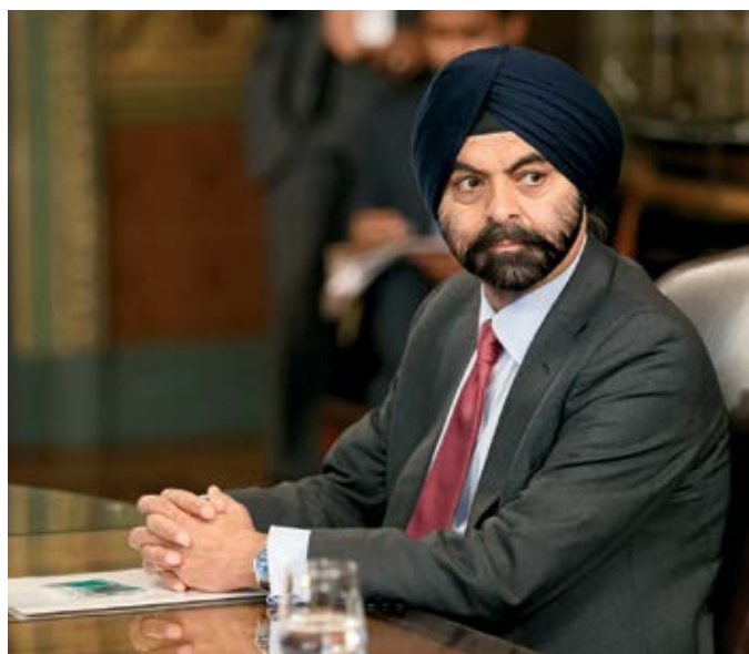
Ajay Banga self-confidently displays his Sikh identity.