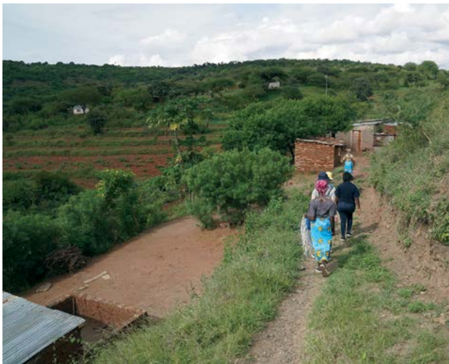
E-government makes life easier for rural Kenyans.

centric. It is necessary to build fully inclusive systems. E-government investments must not come at the cost of maintaining in-person services for those who need a new paper document or who do not have internet access. On the other hand, e-government solutions look particularly promising