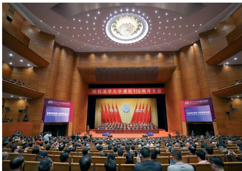
"China's state kept playing a strong role in many sectors, including infrastructure and education": celebrating Tsinghua University's 110 th anniversary in 2021.