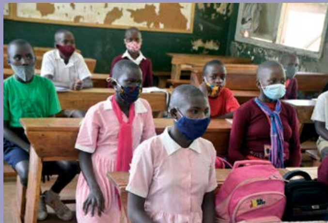
Pupils in Kampala, Uganda's capital.

Outside the established formal education system, vocational education offers a chance to gain skills for practical jobs (see main text). It is usually related to a specific trade, occupation or vocation. In Uganda, a Technical and Vocational Education and Training (TVET) policy was designed in 2019 to address the country's skilling challenges by training Ugandans in vocational skills to prepare them for the job market. Emphasising vocational education is seen as a solution that will produce job creators rather than job seekers. In Uganda, 19.8% of young people are not in employment, education or training, according to the International Labour Organization (ILO). RSS