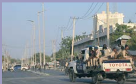
Mogadishu street after a militant attack in late February: journalists cannot move around in Somalia without security guards.

According to Dase, Save the Children is not interested in showing the same typical pictures of children over and over again. The idea is to give reporters access to more complex stories. However, the former filmmaker is aware of serious limitations: "Our own movements in crisis regions are restricted. There is only so much reality we can access and show." BM