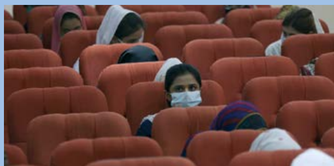
Exam at a university in Peshawar, 2020.