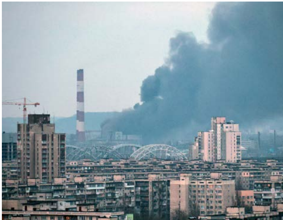
As Russian attacks hit large-scale infrastructure in Ukraine, accessing government agencies via mobile phone serves practical needs.

The Colombian project Kioscos Vive Digital is being implemented by the Ministry of Information and Communication Technologies and supported by UNESCO (UN Educational, Scientific and Cultural Organi-