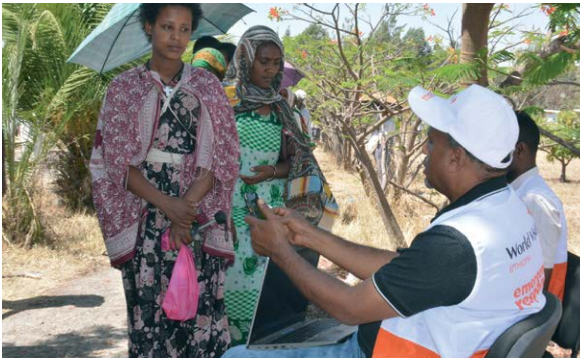
Cash distribution via LMMS during a drought in Ethiopia.