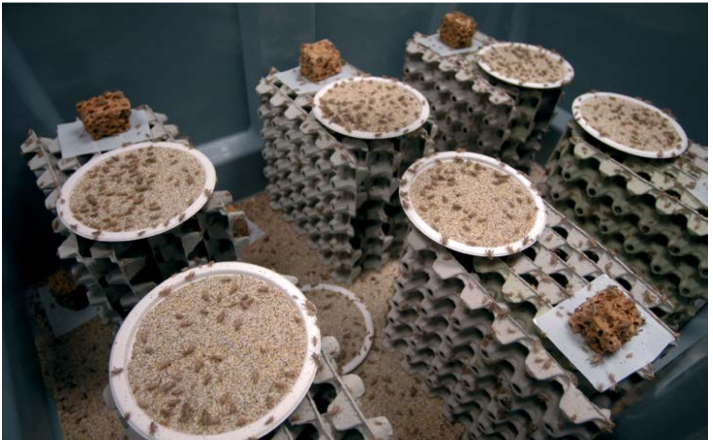
View inside a breeding box of young crickets that are being raised in France exclusively for human consumption.