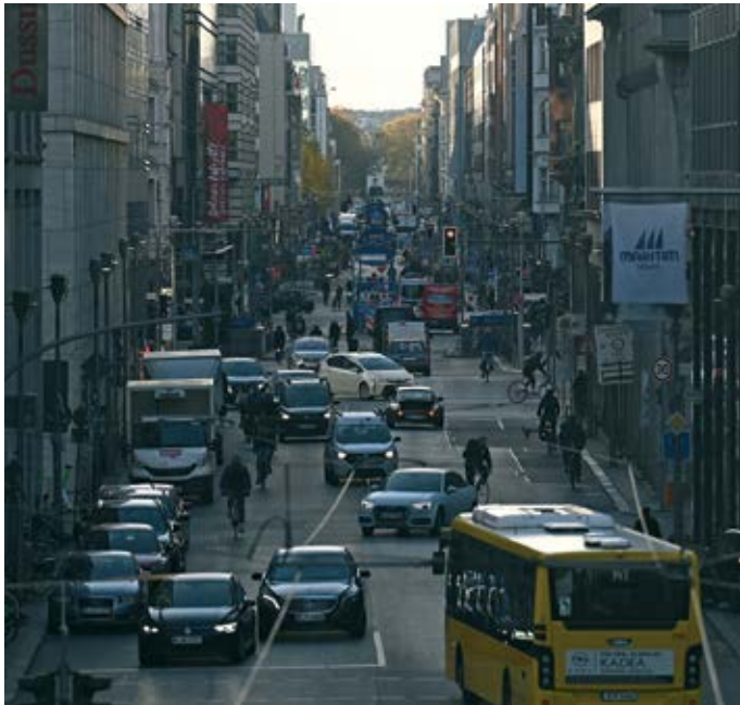
Human drivers process complex information: downtown traffic in Berlin.