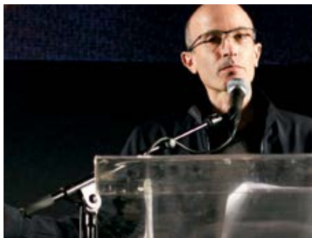
Yuval Noah Harari addressing a protest in March – The Guardian published his speech in its opinion section.

Prime Minister Netanyahu, Justice Minister Levin, MK (member of the Knesset, D+C/E+Z) Rothman, chair of the constitution committee, we do not trust you! You're tearing to shreds the contract that has some-