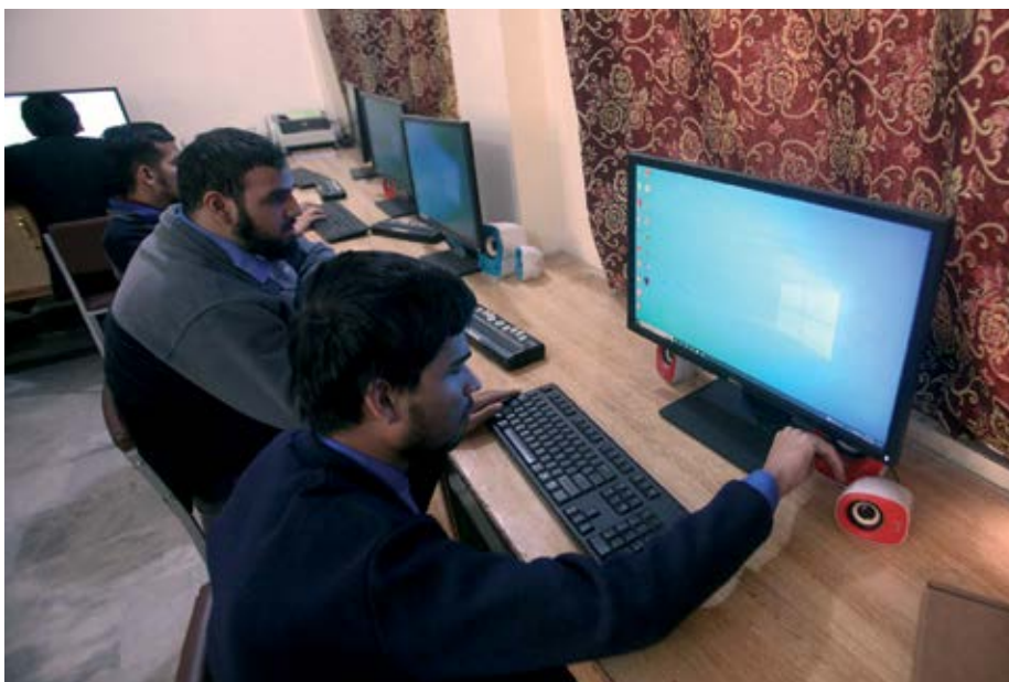
Blind students at a government school in the city of Peshawar, Pakistan.

As the Pakistani government continued to neglect the education sector, private educational institutes have stepped up to the plate, investing in quality education and