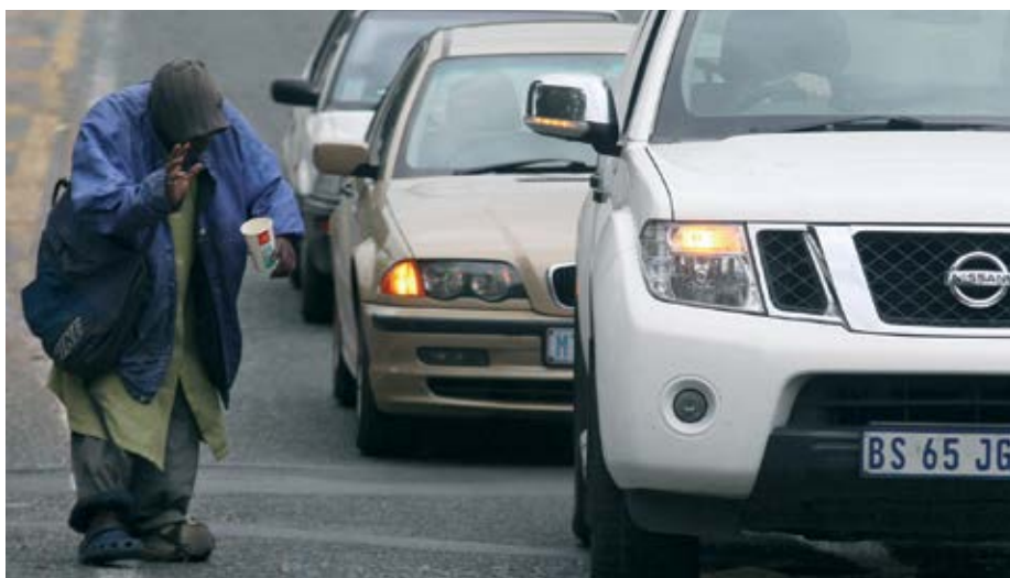
Economic growth that is not sustainable widens the gap between rich and poor in Africa.

The ever more urgent task for activists, researchers, government officers and policy makers is now to unpack the complex relations between growth, poverty and inequality in a way that makes it possible for economic growth to really benefit the people on